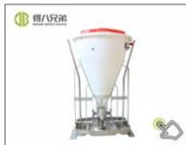
DRY WET FEEDER